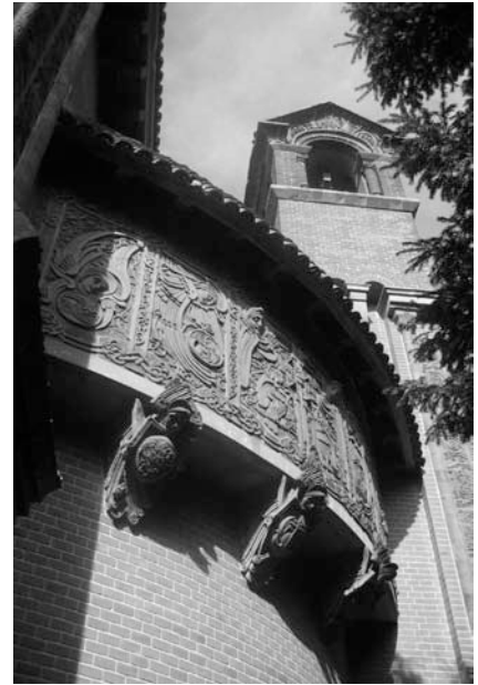
Detail of Watts Chapel.

Despite the fast pace, tea and scones with cream and jam luckily awaited around almost every bend! There was always tea and, thankfully, rest for our weary legs at the Art Workers Guild, where we were engaged by many lectures, including “Artists’ Houses,” “Great Exhibitions,” “The Iron Revolution,” and “The Garden City Movement.” After pinching pence on Marks & Spencer sandwiches and crisps for lunch, dinner was more often than not had at the MIC, where the price was right for the enticing nightly selections (note: avoid the cake). Highlights of touring in London included an exhilarating ride on the London Eye, the Sir John Soane Museum (if we could have only seen it by candlelight...), the vibrant