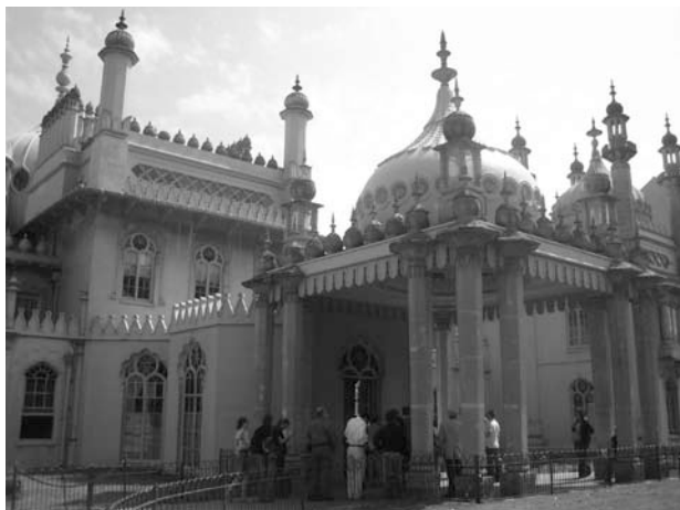
Photos (L to R): Brighton Pavilion. The Palace of Westminster as seen from the London Eye.

had been forgotten!). Over the course of the trip we had learned to navigate ANY site in an hour, complete with all the requisite stops (gift shop, tea room, WC). While I particularly enjoyed seeing the things I had learned about in graduate school before my eyes—the breadth of William Morris, the didactic decoration of Augustus Welby Northmore Pugin, the fanciful ornament of Owen Jones, the spiritedness of Mackintosh—what made the experience truly memorable was the constant companionship of my fellow travelers.