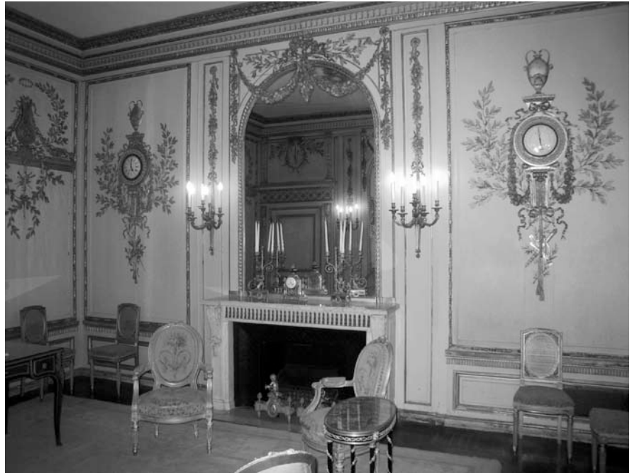
The Gilded Age interior of the Breakers.