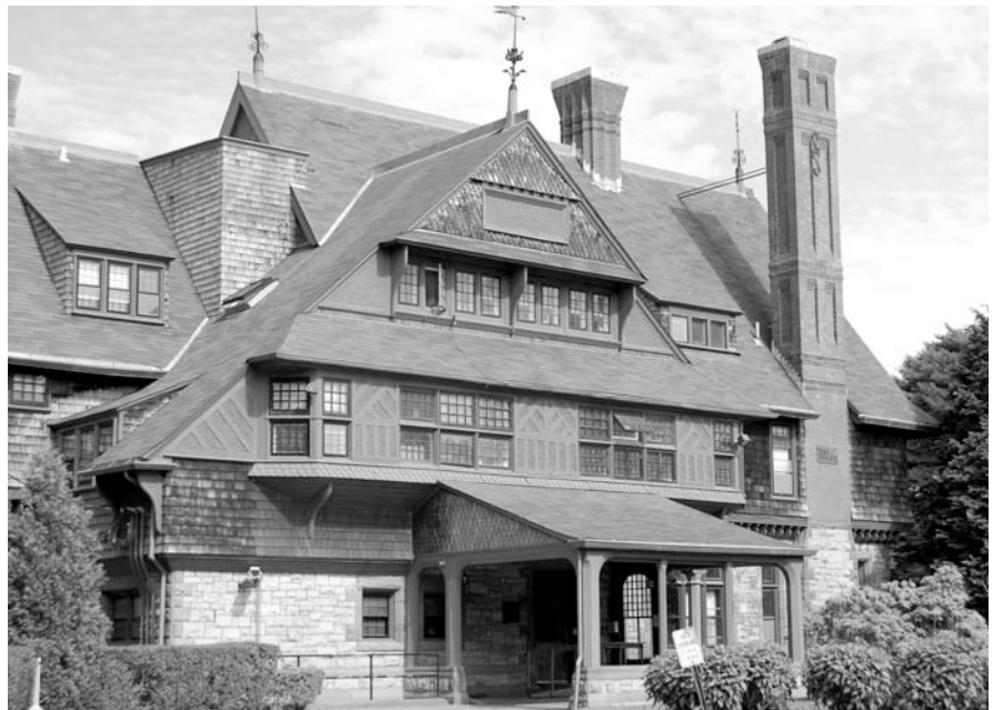
William Watts Sherman house, Newport, Rhode Island. (Henry Hobson Richardson with Stanford White, 1874-76, remodeling, McKim, Mead & White, 1880-81, c. 1900 addition by Dudley Newton).