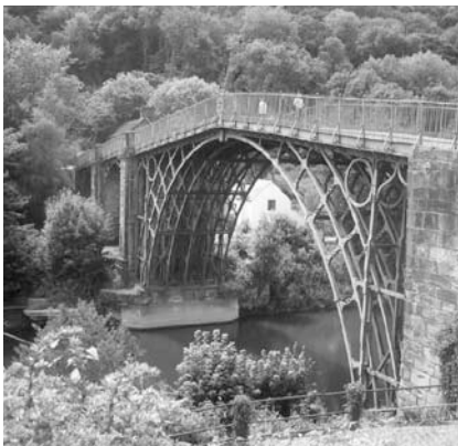
Coalbrookdale Bridge.

A typical day in London started early with a wink from MIC staffer Alexis and a communal eggs-and-bacon-