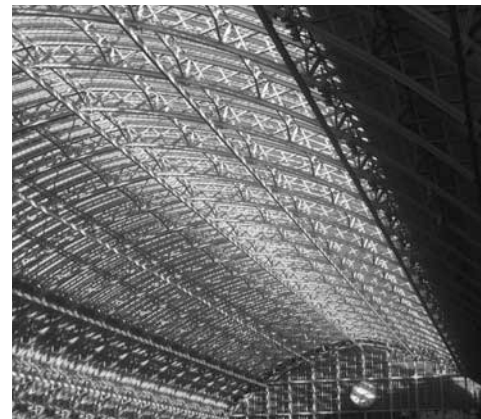
(L to R): Biddulph Grange Gardens . (Photo by Deirdre Pontbriand); The author, Deirdre Pontbriand, relaxing in Oxford . (Photo by Monica Obniski); St. Pancras Station . (Photo by Deirdre Pontbriand)