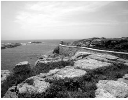
The Newport Cliffwalk.

Our itinerary led us through this history as we balanced lively classroom lectures and discussion with visits to civic and religious sites, museums, private collections, historic homes, the great estates lining Bellevue Avenue, and other buildings maintained by Newport's great preservation and historical societies. We relied on Architectural Tour Notes , our Newport encyclopedia; although most of the course took place in Newport, we also embarked on excursions to other locations, including Providence, Rhode Island, and North Easton, Massachusetts.