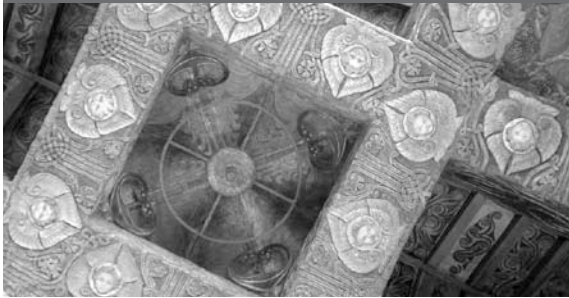
Ceiling of the Watts Memorial Chapel, Compton.